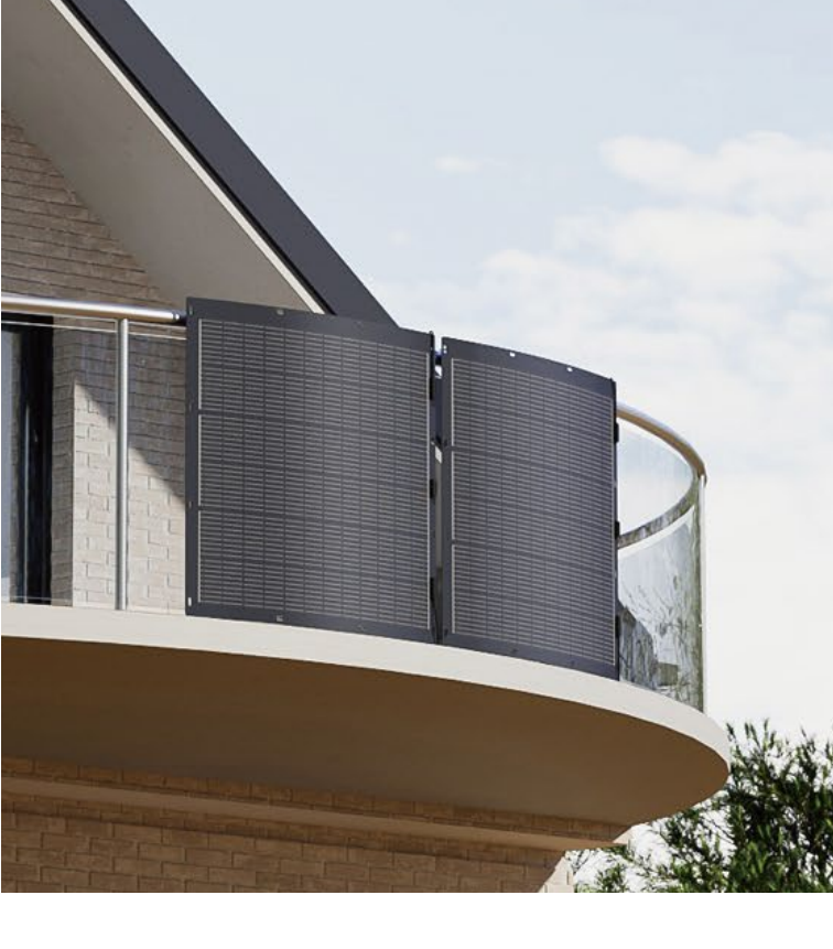
210W Flexible Solar Panel*2